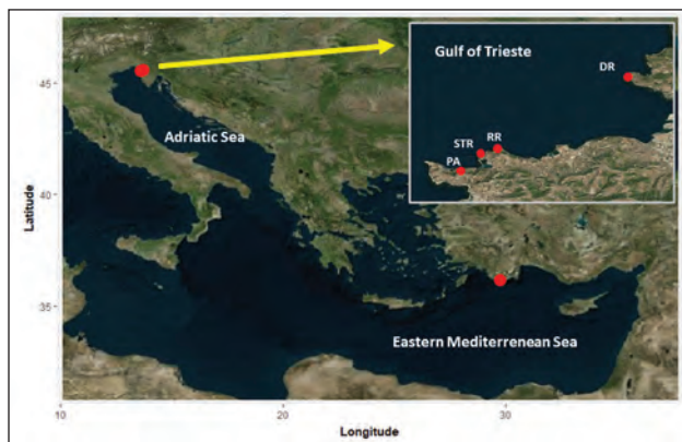
Fig. 1: Areas where Flabelliderma cinari has been recorded to date, with details of sampling sites where specimens of F. cinari were found associated with colonies of Cladocora caespitosa (Debeli Rtič – DR, Pacug – PA, Cape Ronek – RR and Strunjanček – STR).

All specimens soft, light brown. Complete specimens from 6 mm of length and 1.6 mm of width, with 18 chaetigers, to 19 mm long and 5.5 mm of maximal width, with 28 chaetigers. Body slightly convex dorsally, flat ventrally, densely covered with irregular, lobate tubercles covered by fine sediment particles (Fig. 2A, 2B). Tubercles number 13 to 20 per segment at maximum body width. Dorsal tubercles of two different sizes. Many small, more