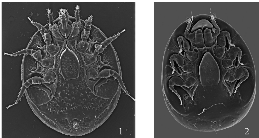
Figs 1-2: Scanning micrographs of Uropodina species from Slovenia: 1: ventral view of Trichouropoda ovalis (C. L. Koch, 1839); 2: ventral view of Urodiaspis tecta (Kramer, 1876).

Triglavská stream (Bistrica), N 46°25,681'E 13° 52,548', 1046m a.s.l., beech forest, leaf litter, 02.08.2008. DL.