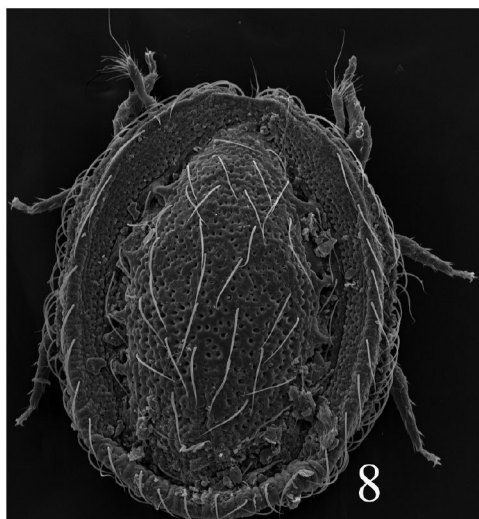
Figs 5-8: Scanning micrographs of Uropodina species from Slovenia: 5: ventral view of Cilliba cassidea (Hermann, 1804); 6: ventral view of Cilliba erlangensis (Hirschmann & Zirnbiegl-Nicol, 1969); 7: dorsal view of Neodiscopoma pulcherrima (Berlese, 1903), 8: dorsal view of Neodiscopoma splendida (Kramer, 1882).

New records: E-2466. Slovenia, Ribčev Laz, leaf litter near the lake Bohinjsko jezero, 03.09.2008. KJ., E-2457. Slovenia, (Sirex), Slovenske Gorice, Slavšina, beech forest 284m a.s.l., N46°31.996'E15°57.631', 25.06.2008. DL+KJ+MD., E-2458. Slovenia, (Sirex), Slovenske Gorice, Slavšina, beech forest 284m a.s.l., N46°31.996'E15°57.631', 25.06.2008. DL+KJ+MD., E-2463. Slovenia, Triglav