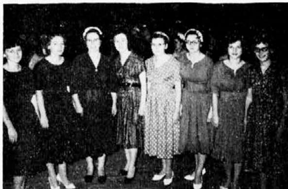
In Eveleth there are seven daughters in a family who are members along with their mother and they performed in song at the Banquet program that afternoon. Our camera caught them at the hall. From left to