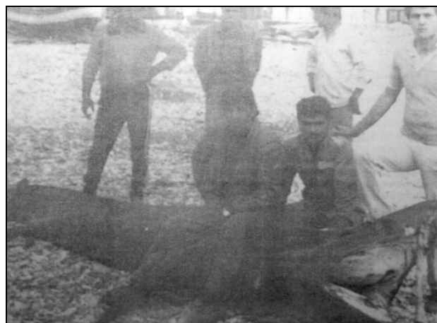
Fig. 2: Basking shark captured off the Kemer coast in the Bay of Antalya (TL 4 m). Sl. 2: Morski pes orjak (TL 4 m), ujet v bližini Kemerja v Antalijskem zalivu.