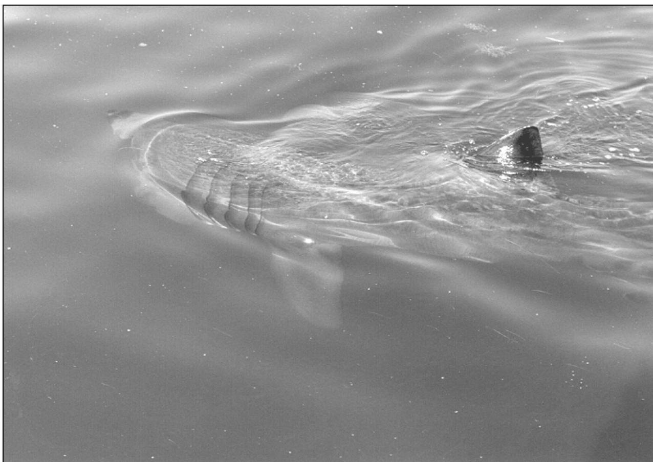
Fig. 3: Basking shark ( Cetorhinus maximus ) grazing at the sea surface in inshore waters. Sl. 3: Morski pes orjak ( Cetorhinus maximus ) se pase na gladini priobalnega morja.

The author wishes to thank Mr Agop Savul for his kind permission to work in his archive.