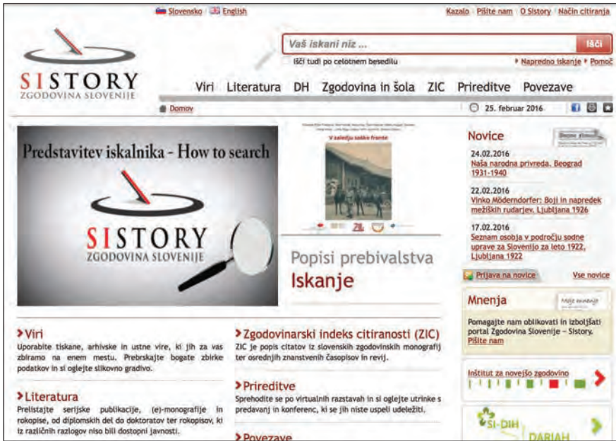
Figure 1: Home page of the History of Slovenia – Sistory portal of 2016