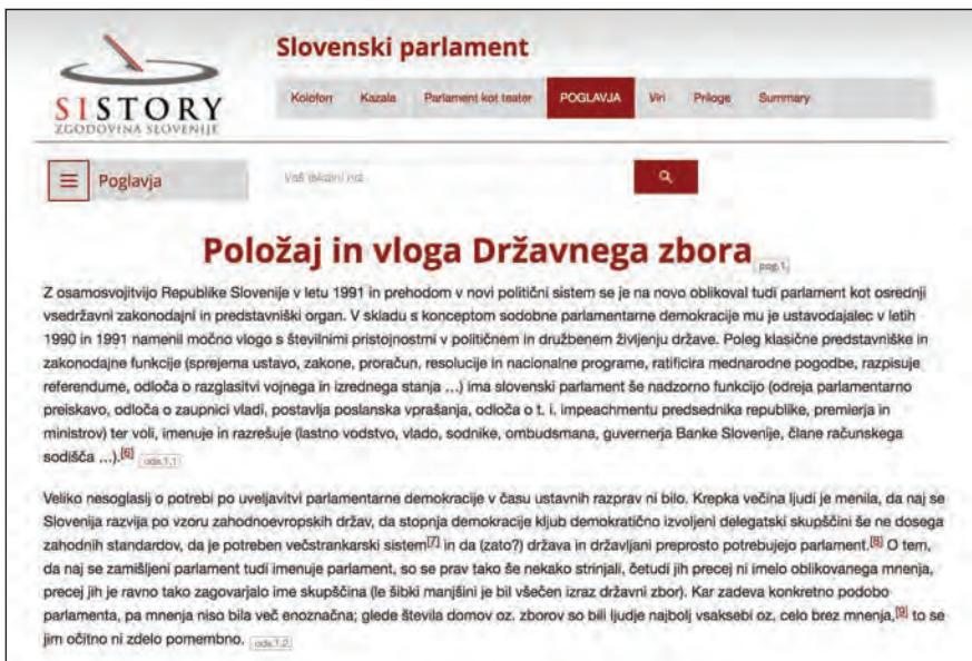
Figure 2: The 2014 digital edition user interface