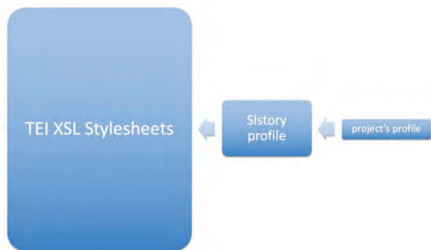
Figure 8: Chained XSLT conversions with additional profiles

Much like the main XSL Stylesheets of the TEI Consortium, the Sistory profile has been created to allow for its adaptation to the requirements of any individual project. To this end, it includes a few original parameters of the TEI Consortium's XSLT stylesheets which affect the default stylesheet output, to which I have added a few new Sistory parameters. All of these parameters can be set up anew for each conversion, but it is more appropriate that new project profiles be created for each individual project. The conversion usually proceeds in the following manner: the project's custom profile imports the Sistory profile, which, in turn, imports the TEI XSLT transformations, and adds overrides (see Figure 8).