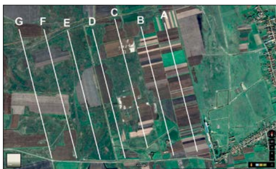
Figure 1: The seven transects in the alkali grassland area near Stanišić (NW Serbia)

Slika 1: Sedem transektov na območju bazičnih travišč blizu Stanišića (SZ Srbija)