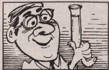
The first antibiotic was penicillin, discovered by British scientist Alexander Fleming in 1928.

The only thing wrong with immortality is that it tends to go on forever. --Phil Hrvatin