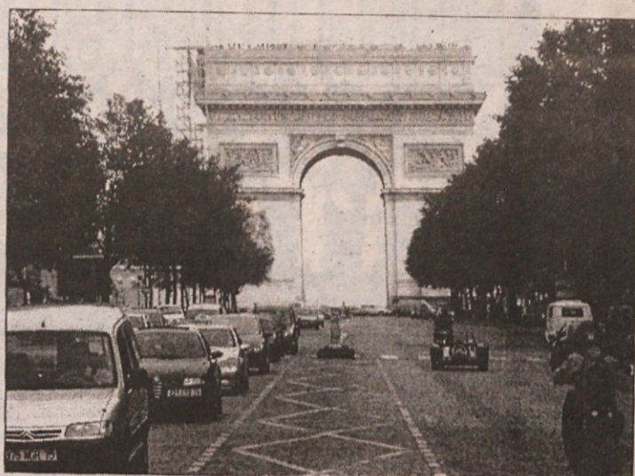
Tourists like the top of the Arch de Triumph

I wonder if they are aware of they are in the middle of the Frankie Yankovic Cleveland-style polka territory and home of the Slovenian-Viennese waltz? And, I wonder if the Slovenian Community is aware of such a talented Russian group performing for the Cleveland Orchestra and elsewhere with Slovenian folk music.