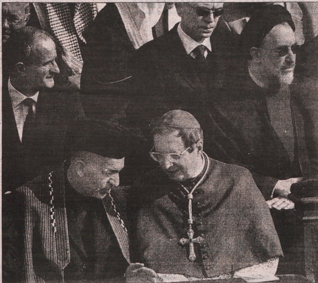
PREDSEDNIK JANEZ DRNOVŠEK NA POGREBU PAPEŽA JANEZA PAVLA II. – Fotografija, ki jo je na svoji prvi strani objavil list Delo , ima Drnovška v skupini državnikov, med katerimi je spodaj levo afganistanski predsednik Karzaj, na desni pa gotovo iranski predsednik. Med osebami je list identificiral samo Drnovška.