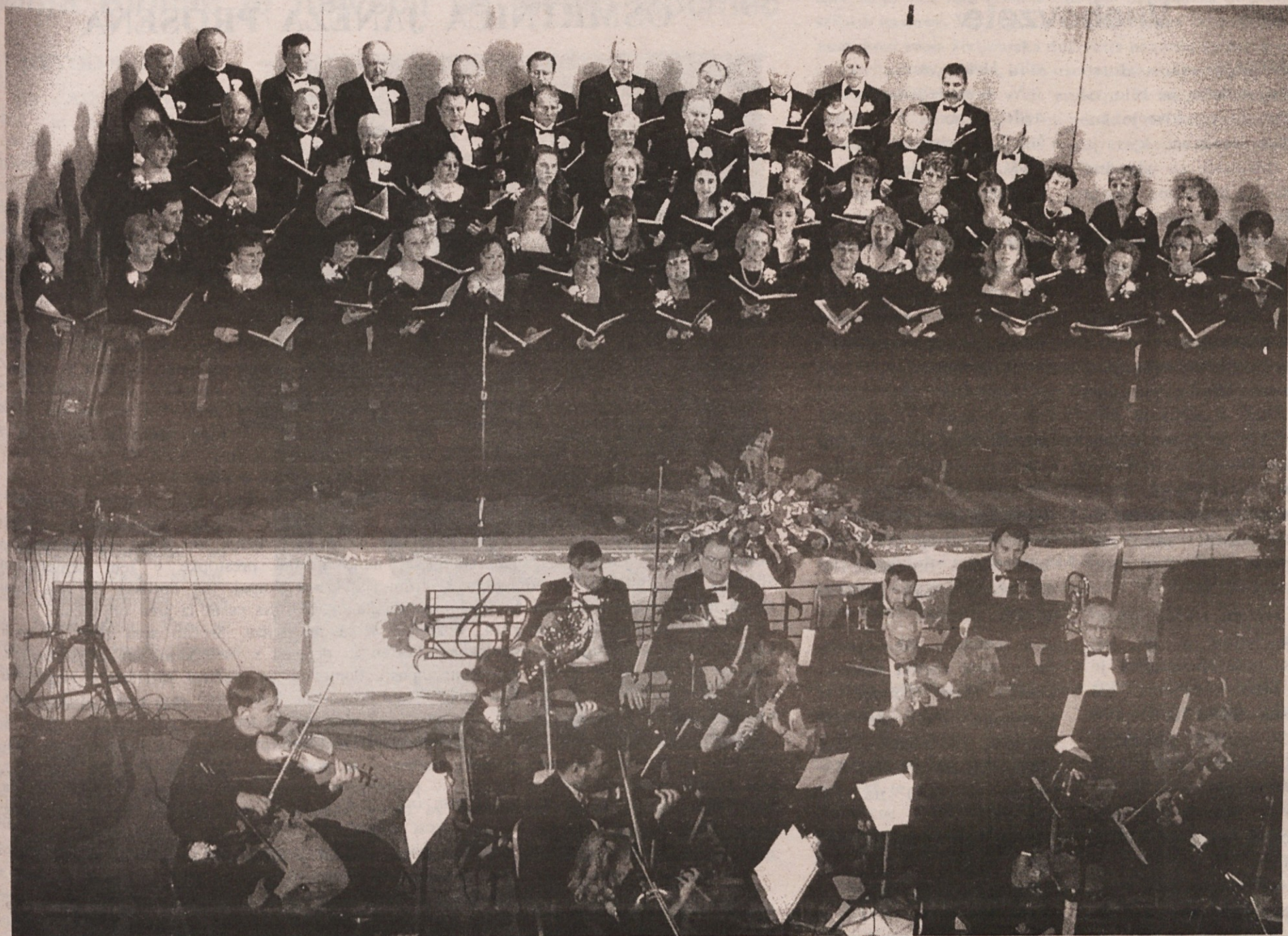
Pevski zbor KOROTAN – Fotografija posneta na koncertu ob 50. obletnici ustanovitve