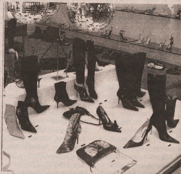
Stylish shoes and boots in a window on the Champs Elysee.