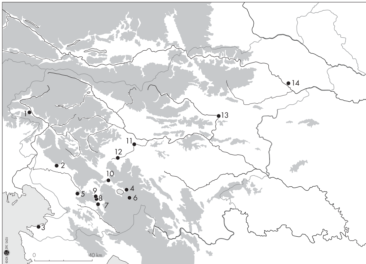
Fig. 3: The distribution of Republican victoriati in Slovenia.

Sl. 3: Razprostranjenost republikanskih viktoriatov na območju Slovenije.