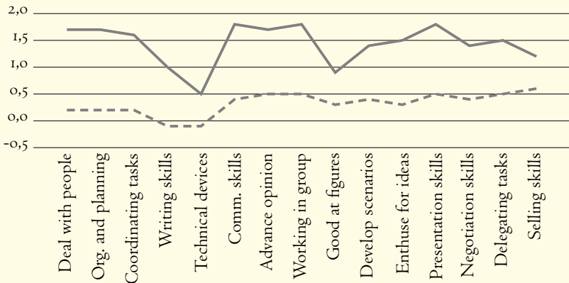
FIGURE 2 Comparison of skill advantage of JE members against regular students to self-evaluated skill improvement because of JE membership (both measured with a six-point Likert scale; for skill improvement 3,5 is the zero point on the scale; gray line – skill advantage JE, dashed gray line – skill improvement)

experience in the JE or differences in the samples, such as the field of study, sex or country of origin.