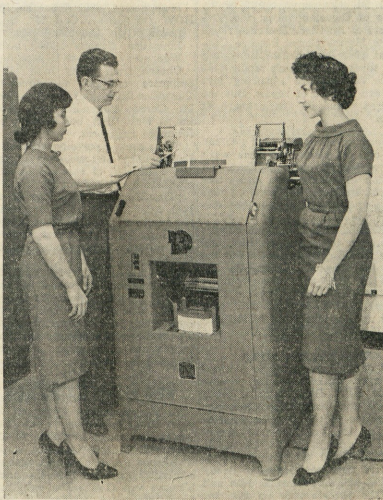
This unit of the new Remington-Rand Univac Computer is part of a recent installation in the main office of the St. Clair Savings Association. Punched cards, representing customer accounts, are fed into the equipment for automatic computation and verification of balances.