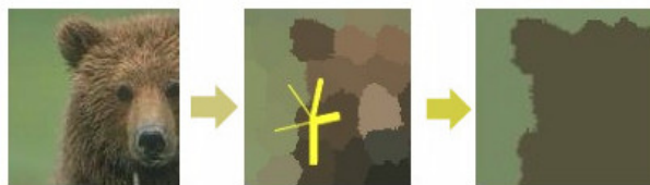
Figure 1. From left to right: input image, an example of the MRF pairwise consistency encoded by color similarity, and final segmentation.

Broadly speaking, the image is said to be comprised of superpixels if the number of segments is in the hundreds, though there is no precise definition. Most methods can produce both coarse and fine segmentations, which can sometimes be controlled by adjusting the method parameters. We use the words segment, region and label interchangeably, since segments are defined as all the