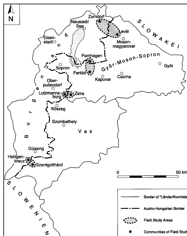
Map 1: Field study areas of the Austro-Hungarian border.

The regions on both sides of the border share many similarities and do not only meet spatially. During the last years, INTERREG- and PHARE-projects supported cross-border co-operations and political plans emerged to gain the EUREGIO-status for this border region, which until 1918 has more or less altogether been part of the Hungarian kingdom. The relative economic similarity of the immediate cross-border-regions and common cultural traditions (at least until 1921, if not until the end of World War II) allow a basis for a fruitful neighbourhood policy, although the two border regions belonged to different political systems over a period of more than four decades. As a whole, the geographical situation of the border region – also regarding the natural environment – presents a relatively favourable precondition for future cross-border co-operations. Against this background, we were interested in the recent status of bilateral perception patterns, activity spaces and cross-border co-operation perspectives ten years after the fall of the Iron Curtain.