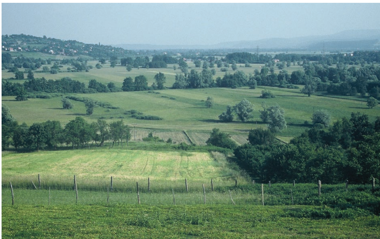
Figure 2: Wet meadows in the cultural grassland landscape of Jovsi. Slika 2: Mokrotni travniki v kulturni traviščni krajini Jovsi.