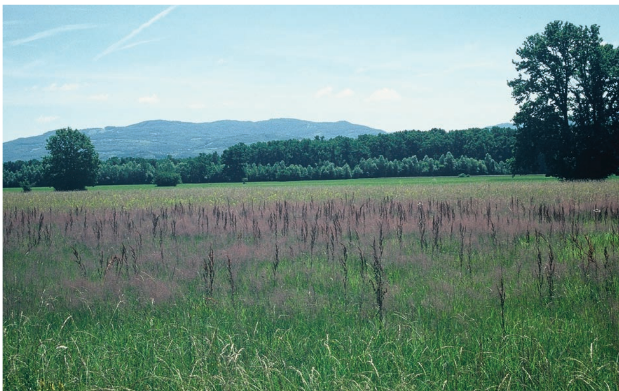
Figure 3: Wet meadows in the forested landscape of the Krakovo forest. Slika 3: Mokrotni travniki v gozdnati krajini Krakovskega gozda.