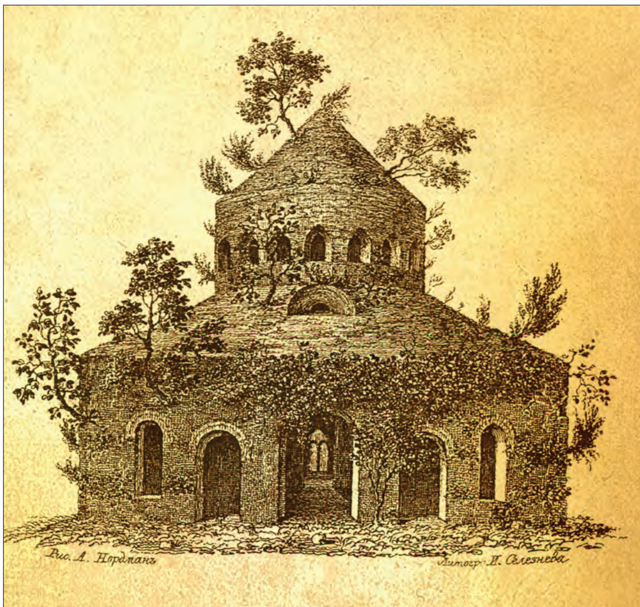
Figure 6: The Cathedral of the Dormition of the Mother of God in Dranda; a lithograph after a drawing by A. Nordmann, 1835

who, being illiterate, have never enjoyed much respect and have, therefore, never been able to compete with their Mahometan counterpart, with its mysterious Quran replete with wisdom, which, according to the Adyghe, was written by almighty Tkha himself. These old priests hold their church services and rites openly only in certain places on the shore of the Black Sea; and most of the time they pray in secret; the new Mahometan clergy hate them and persecute them" (Łapiński, 1995).