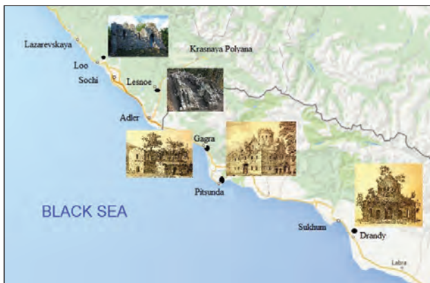
Figure 7: A diagram map of the area's major historical-cultural heritage sites

notes in his diary: "Since the Russians have taken possession of the old church and convent at Vadran, and fortified them, I have been assured that the Abasians