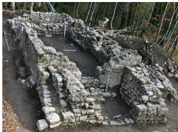
Figure 4: The Byzantine temple in the rural locality of Lesnoe (the basilica Lesnoe-2)

walls' thickness is up to 1.1 meters" (Voronov, 1979).