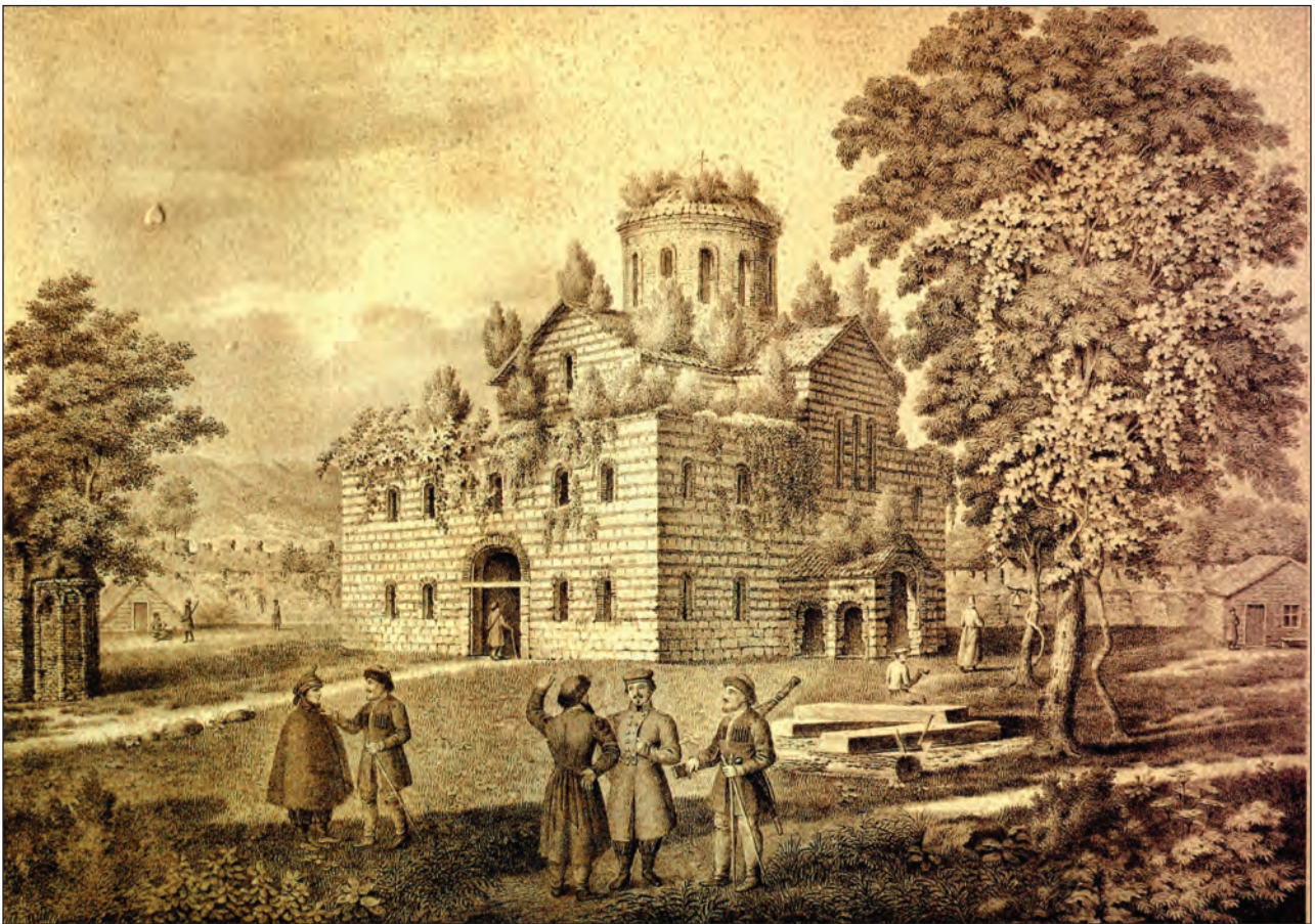
Figure 5: The temple in Pitsunda; a lithograph after a drawing by Frédéric DuBois De Montperreux, 1833

parts, which made it look compartmentalized. The main construction material was ashlar stone. So, we have every reason to believe that in building temples in this area they used the same construction materials, forms, and techniques.