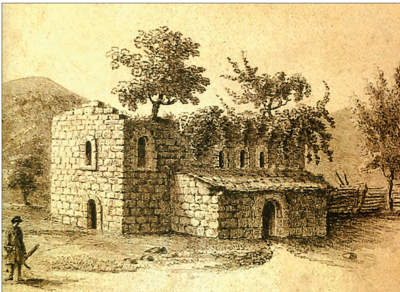
Figure 8: The Temple of Saint Hypatius of Gagra (the early 6th century) An engraving after a drawing by Frédéric Dubois de Montperreux, 1833

It is worth noting that in 1836 there were a great many non-Moslems among the mountaineers in the area. The destruction of Christian monuments must have caused controversy among the Christian-Pagan clergy and their congregation. A role here was played by the Islamic version of a military-political reason for the destruction of Orthodox churches and monasteries. To be able to effectively sort this issue out, we need to examine the geographic location of those structures – say, the one in Loo. As we have mentioned above, the temple is 200 meters above sea level and 2 km from the seashore. Sending landing forces down there meant a virtual death sentence for them, for they would be easily encircled by the enemy. This means it was totally impossible to use the temple as a military site or a strongpoint during the