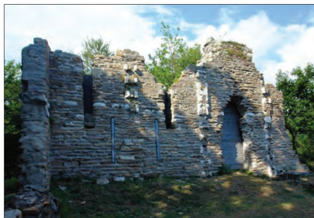
Figure 2: The ruins of the temple in Loo; its present-day condition

In the territory of the present-day Black Sea area from Anapa to Abkhazia, there is not a single undamaged medieval temple that has survived to this day. During the period between the 10 th and 12 th centuries, this territory was part of the Zikh diocese in the Constantinople Orthodox Church. Afterwards, the Europeans would long