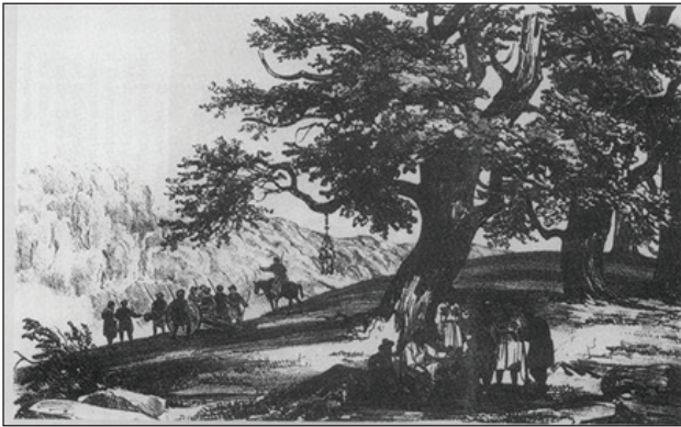
Figure 9: An ancient cross hanging on a tree near the village of Socha

Caucasus War. On top of that, temples in the Black Sea area were small in dimensions (no more than 100 square meters), which meant their garrison could not have consisted of more than 10 men. Thus, the region's cult structures were not likely to pose any military threat.