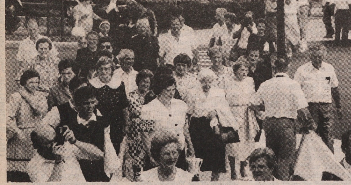
Hundreds of persons attended all events.