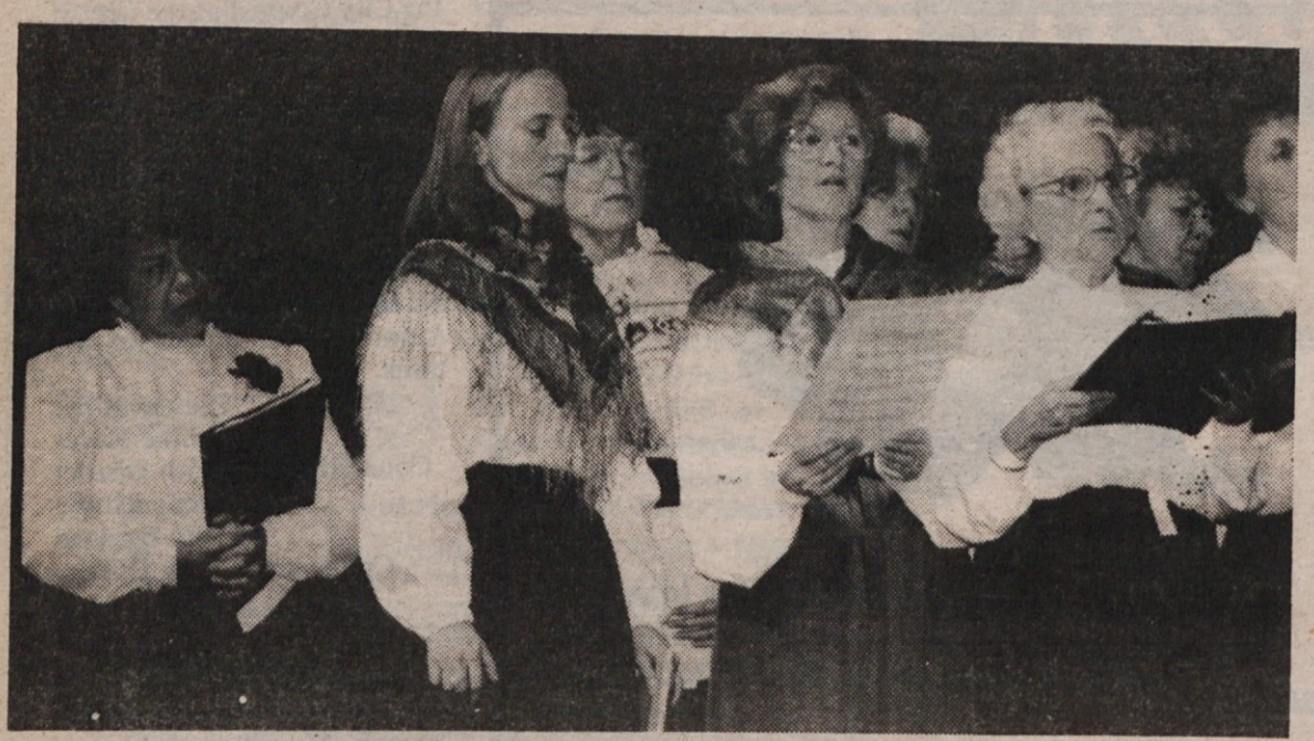
The Washington, D.C. choral group in concert.