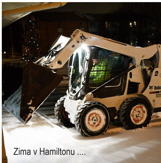
Zima v Hamiltonu ....